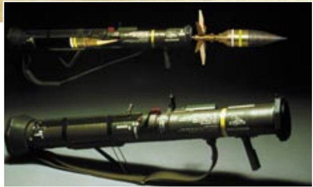
The AT4 projectile and launcher cut away model.

The AT4 is the fightingman's weapon – it's easy to use, accurate, extremely effective and available.