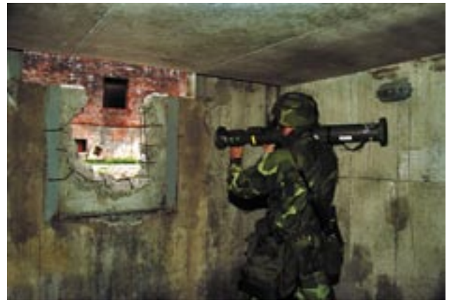
The AT4 CS fired from confined space.