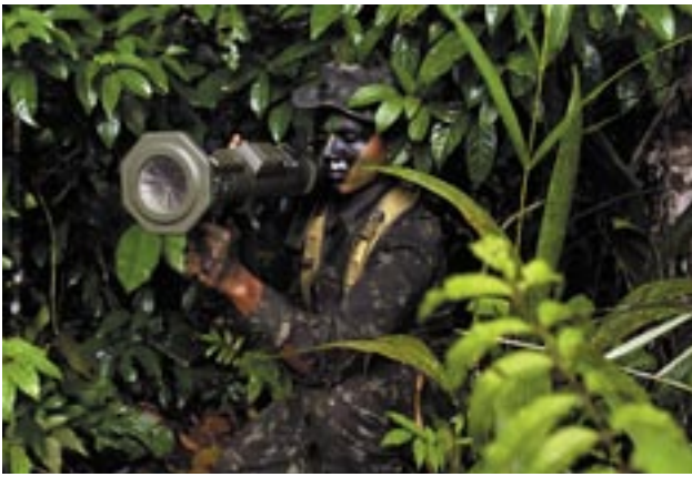
The AT4 CS in jungle warfare.