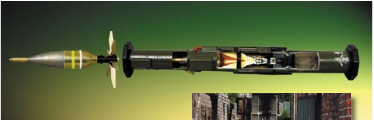
The AT4 CS projectile and launcher cut away model.